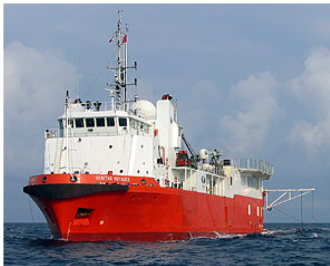
M/V Veritas Voyager will take part in the seismic survey in January 2007

Production from the remaining four wells will continue as normal, with about four cargoes loaded to tankers a month.