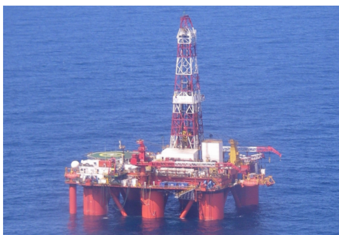
Nan Hai VI will drill the development wells for Vincent

As at the end of January 2007, we had loaded 15 cargoes, with delivery destinations including refineries in Australia, Japan, Korea, Singapore and the United States. About the half of the oil from Enfield has been sold into the Australian market.